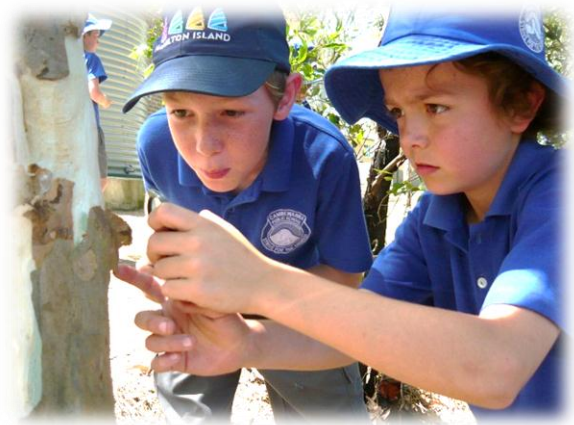
Outdoor Education Centre Visit