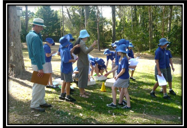
Outdoor Education Centre Visit

Mon Dec 10 – Fri Dec 14 Stage 3 Camp to Yarramundi