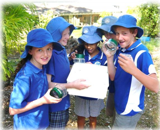
Outdoor Education Centre Visit