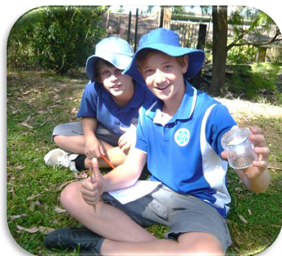
Outdoor Education Centre Visit