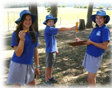
Outdoor Education Centre Visit

Bedwetting is common in children and causes anxiety around the time of school camps. For more information and a free Bedwetting Fact Sheet please visit www.bedwettinginstitute.com.au or phone 1300 135 796